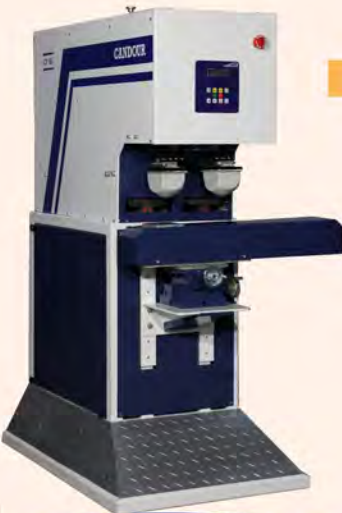
CP 150 D