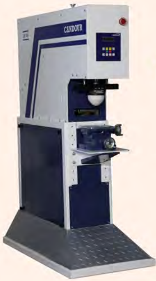
CP 150 S