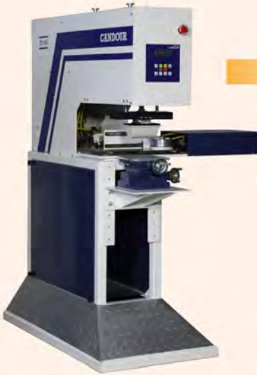
CP 150 H