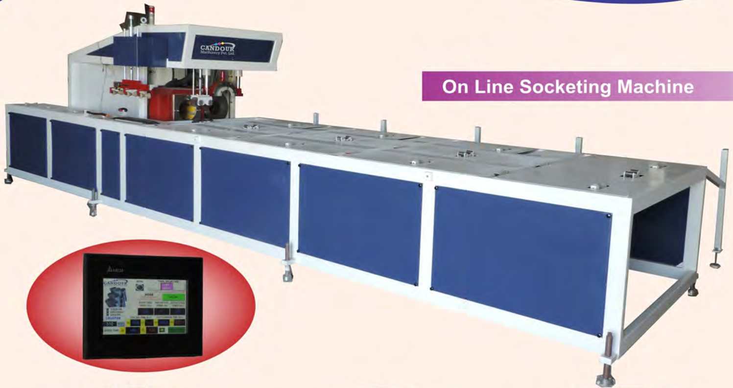
On Line Socketing Machine

Single Machine is Suitable for Solvent cement Joint, SWR Joint & Ring Fit (RR) Joints. Changing Mode for variant is by only selector switch only. Balance all will be fully Automatic.