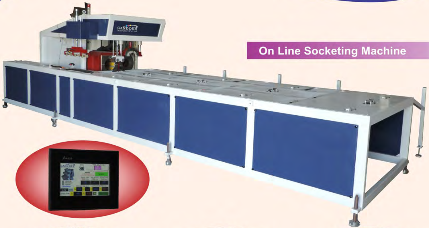
On Line Socketing Machine

Single Machine is Suitable for Solvent cement Joint, SWR Joint & Ring Fit (RR) Joints. Changing Mode for variant is by only selector switch only. Balance all will be fully Automatic.